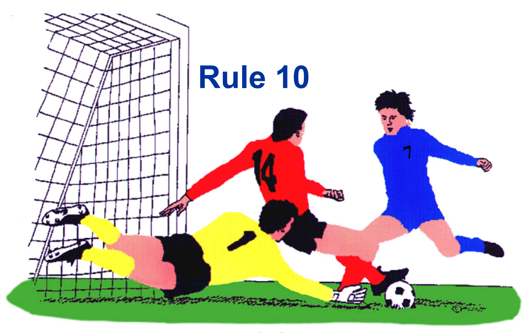
Method of Scoring