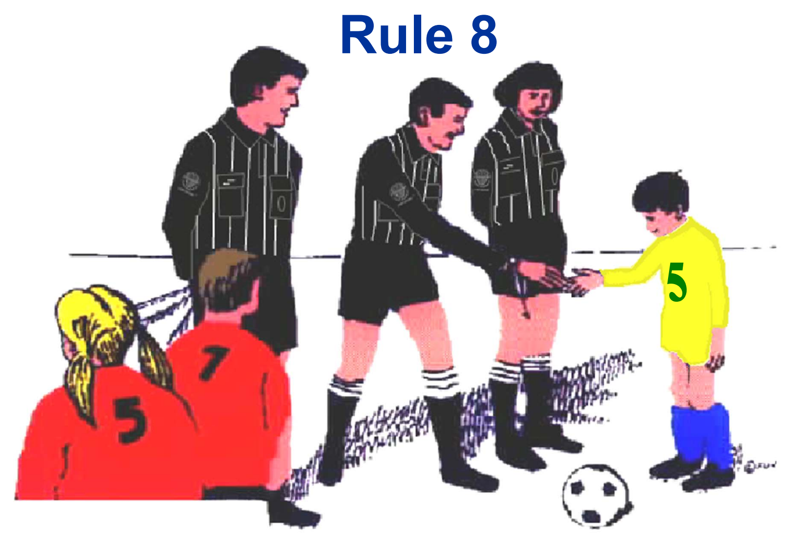
The Start of Play